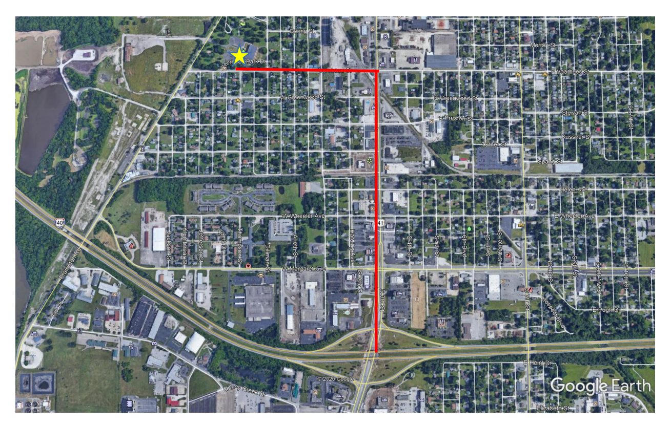
From I-70 to Voorhees Park

Demonstrators FOR capital punishment can assemble at Voorhees Park