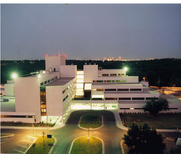
3 FMC Carswell, Medical Referral Center, with the Fort Worth skyline in the background

A 24-bed Administrative Unit. This high security unit is designed to house female inmates with histories of